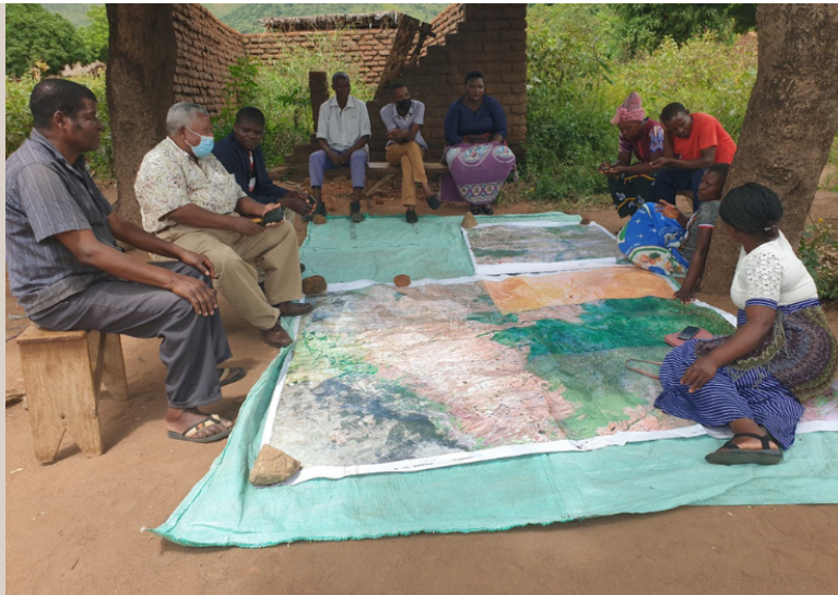
Public Display of Adjudication and Demarcation Data in Phalombe District

Legal Review 2. Following the election of a new Government in June 2020, the President of Malawi ordered a review of the new land laws, to be led by a specially constituted “Land Law Review Committee”. DAI’s Legal expert worked with the committee to compile comments on the laws from stakeholders, including at a workshop, and then worked with the committee to produce a report, with recommendations for changes to the laws.