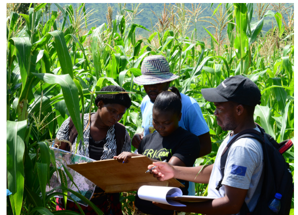
Field work, Maoni village, Phalombe District