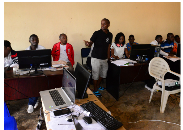
Training in Phalombe field office