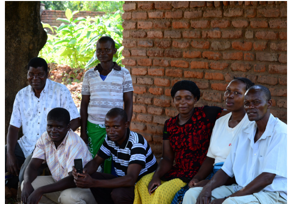
Maoni Customary Land Committee, Phalombe District

Developed a Land Reform Implementation Plan: Supported the MoLHUD to develop a Land Reform Implementation Plan, focusing on the pilot phase of land reforms.